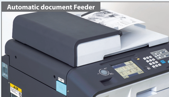
Automatic document Feeder

Clearer outline of the flower petals when using the NEW Graphic feature