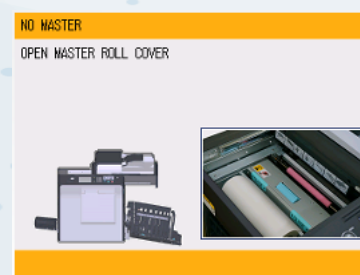
Consumable alarm message